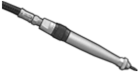
Part 1564T62 Housing Estimated cost $285.80

Link: http://www.mcmaster.com/#1564t68/=3fhywv